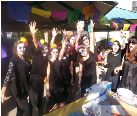
Middle School Dance 2014 "Día de los Muertos"